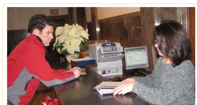
The three appellate court clerk's offices in Knoxville, Nashville and Jackson processed more than 25,000 filings in FY 2006-07, including motions, briefs, orders and appellate court opinions.

• The AOC is an annual sub-recipient of a federal grant through the Tennessee Department of Human Services (DHS), Child Support Division. The grant is for establishing programs to support and facilitate noncustodial parents' access and visitation with their children. The state uses the funding to assist self-represented divorced and never married parents. Grants during 2006-07 have been