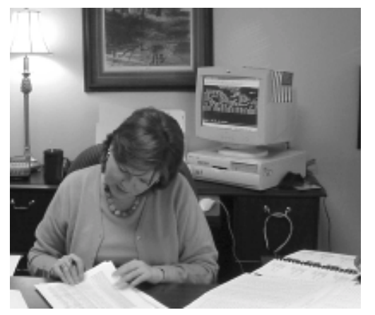
AOC staff. The division works with judges and AOC management in developing position descriptions, recruiting, interviewing, hiring, training, employee evaluations and employee separation. Other responsibilities include approving salary adjustments, overseeing employee benefits, monitoring Workers' Compensation claims and leave under the Family Medical Leave Act (FMLA) and consulting with management regarding a wide variety of employment issues. The division also is responsible for Affirmative Action and Title VI compliance.

The Human Resources Division addresses the human resource needs of nearly 700 court system employees statewide, including trial and appellate court judges and