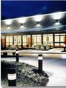
Conference Center at Montgomery Bell State Park

http://www.tennessee.gov/environment/parks/parks/MontgomeryBell/