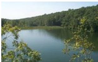
Lake Acorn at Montgomery Bell State Park

From Memphis: Take I-40 East to Exit 182 (Fairview/Dickson Hwy. 96 Exit). Turn right (West) onto Highway 96. Stay on Highway 96 until it dead ends at Highway 70. Turn right (East) on Highway 70, off-ramp provided. Stay on Highway 70 approximately 3 miles. Park entrance is on the right.